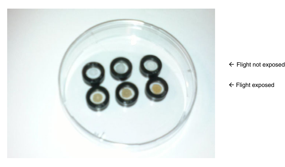
Fig. 1. Windows recovered with samples exposed to the Sun (yellow) and non-exposed samples (white) onboard ISS.

ADHR can react with a wide range of adenine analogues and acts with different catalytic strategies compared with the wild-type ribozyme. Finally, the structural properties of plausible RNA vestiges of early life were recently studied according to external perturbations (Delan-Forino et al. 2014; Hui-Bon-Hoa et al. 2014).